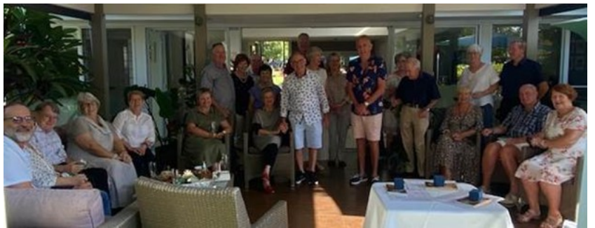
Conference members and partners enjoying the special occasion