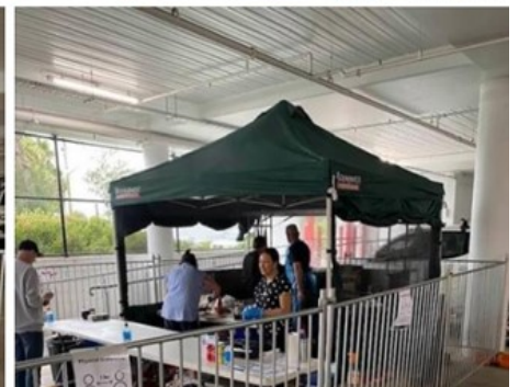
Sutherland Conference members and family