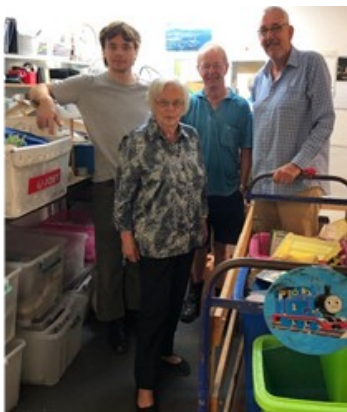
"No one can whistle a symphony. It takes a whole orchestra to play it." Halford Luccock

Maroubra Volunteers, we appreciate your ongoing help. It is a delight having you around.